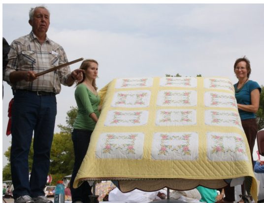
One of many quilts auctioned

At noon, the main auction started with the traditional loaf of bread, which will be used in the Sunday communion worship service. The loaf of bread sold for $1600. The highest paid for a quilt this year was $2500, for the "Colorwash Irish Chain, queen sized quilt. The "Trip Around the World/Star King" quilt, made by the MCC Quilt Room, Ephrata, Pa, brought in $2100.