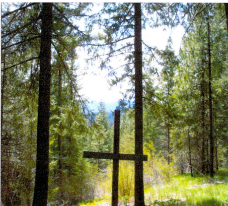
Cross at Camp Camrec

In addition to visiting the equator near Quito, the major attraction in Ecuador was the 7 day trip to the Galapagos Islands. Four nights were aboard the ship Tip Top III and two nights were spent on Santa Cruz Island. Five different islands were visited.