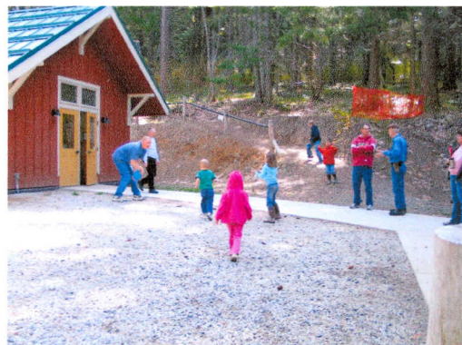
Kids playing with bubbles